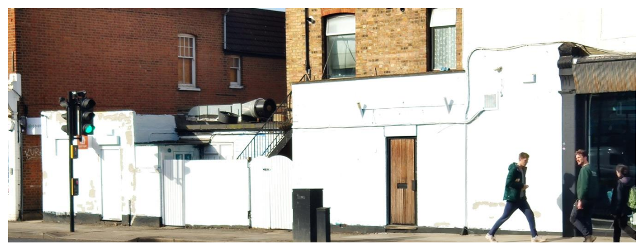
After advetisement removed