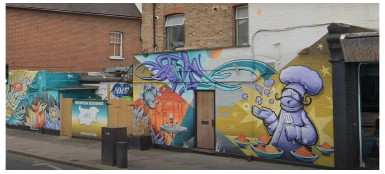
Before-Advertisement of restaurant

Officers visited the property and discussed with the owner and staff of the restaurant, after negotiations, it was moved via informal enforcement action, the results are below.